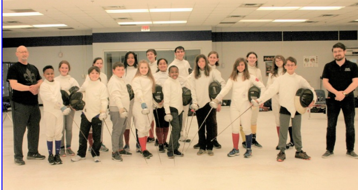
June 28: The inaugural DHS Fencing Camp - Class of 2018. A week of camaraderie, competition, honing skills, and smiles.